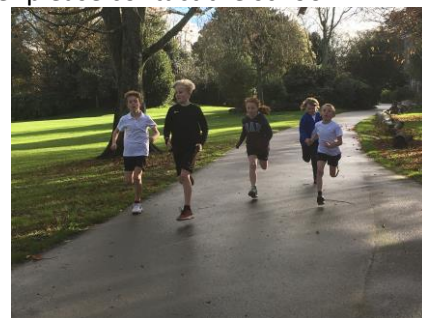
Epic Running at Sausmarez park

We held the last of our enrichment afternoons last week, ending 4 afternoons of adventurous and creative (and often messy) activities. The children tell us that they got a lot from the sessions and would like us to do something similar again next term. If any parents feel that they could offer an activity – with our help of course- please contact the school.