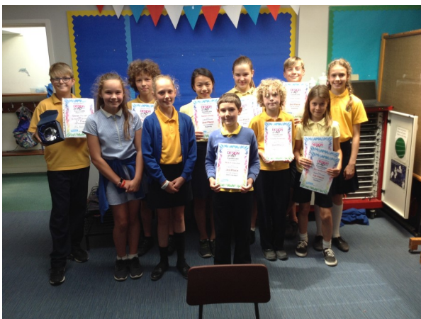
Our proud winners!